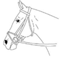
4: Crossed noseband (Grackle or Mexican)