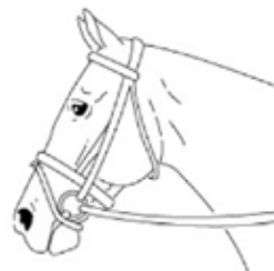
3: Flash noseband (Hanoverian)