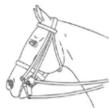
Double bridle with cavesson noseband, bridoon bit and curb with curb chain.

1, 3, 4, 5 or 6 are not permitted when a double bridle is used.