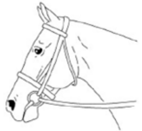
2: Cavesson noseband