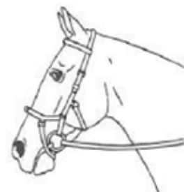
6. Micklem bridle

1, 3, 4, 5 or 6 are not permitted when a double bridle is used.