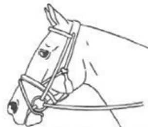
5. Combined noseband – no throat lash