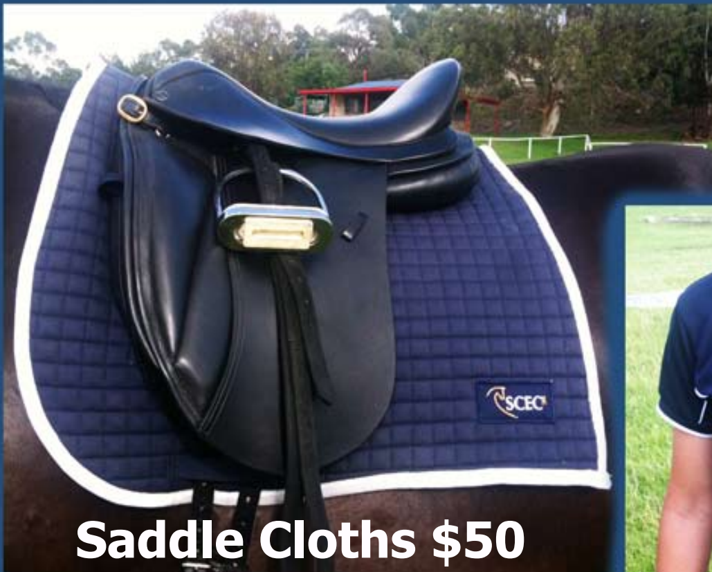
Saddle Cloths $50