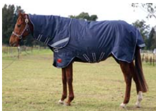
1200 Denier Winter Combo Set Latest European design, detachable Neck, 280 gm fill, triple cross surcingles 100% breathable and waterproof $150 5'0" - 6'9"

www.paddockwarrior.com.au paddockwarrior@bigpond.com