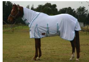
Cool Mesh Lightweight Combo poly mesh super cool fabric, attached neck, integrated belly wrap, action shoulder gusset, perfect for hot days and preventing the itch! $90 5'0" – 6'9"

Unit 1/242 Nolan St Unanderra (Cnr Investigator Dve). Open Mon – Fri 12 -5 pm Sat 9 – 4pm Mail Order available, credit cards accepted.