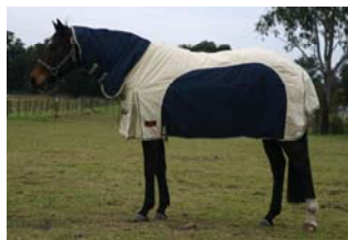
600 Denier Winter Combo Attached neck, action gusset, two tone colour design, single surcingles, 220gm fill, 100% breathable and waterproof $120 5'0"- 6'9"