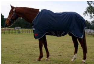
600 Denier Summer Rug Latest European Design, triple cross Surcingles, cotton lined, no fill, 100% breathable and waterproof $90 5'0" – 6'9"