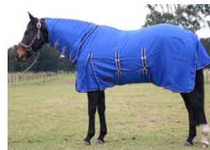
600 Denier Summer Rainsheet Attached neck, action gusset, large tailflap, integrated belly wrap, unlined, adjust legstraps breathable waterproof shell for rainy warm days $80 5'0" – 6'9"