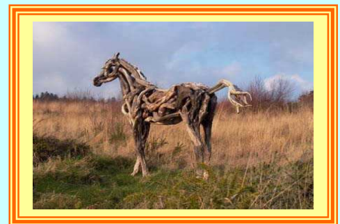
Stranger that Fiction – Driftwood Horse