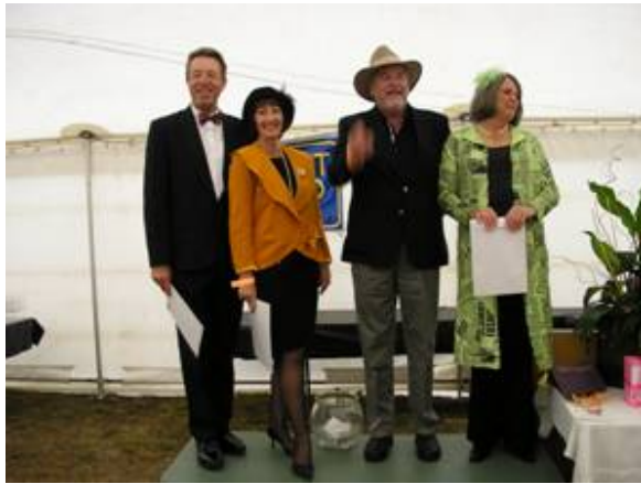
SCEC Fashion on The Field finalists