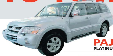
PAJERO PLATINUM EDITION