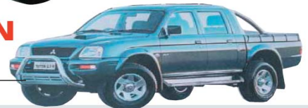
TRITON GLX-R DUAL CAB